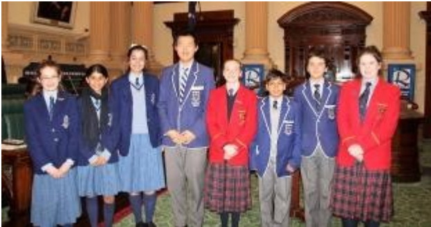
THE STATE FINALISTS

53 Rostrum members assisted in the Heats, Semi-Finals and Zone Finals, many more than once.