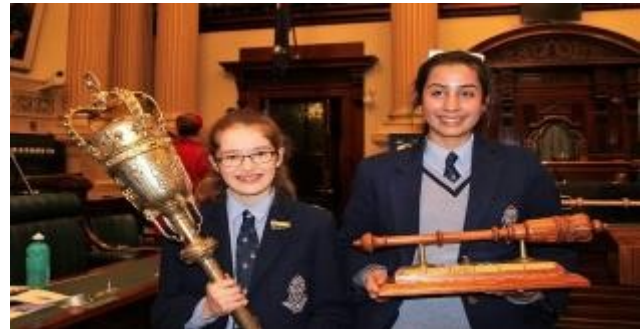
HOLDING THE MACE